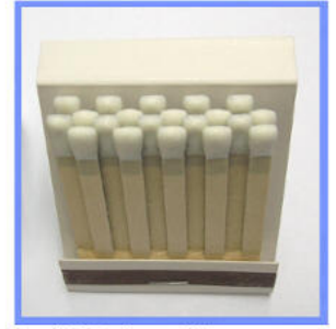
Book Matches with 2 rows of matches